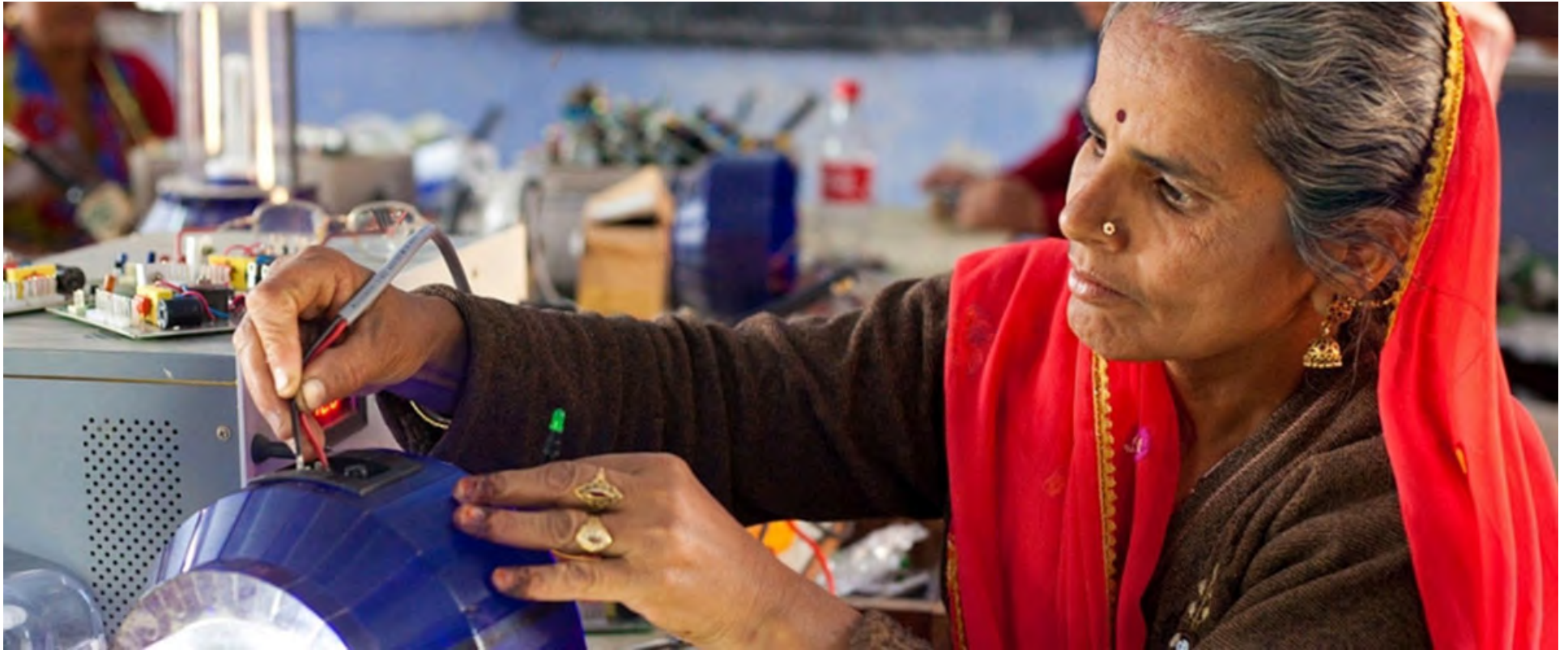
Image: Solar engineering trainer, Barefoot College, India