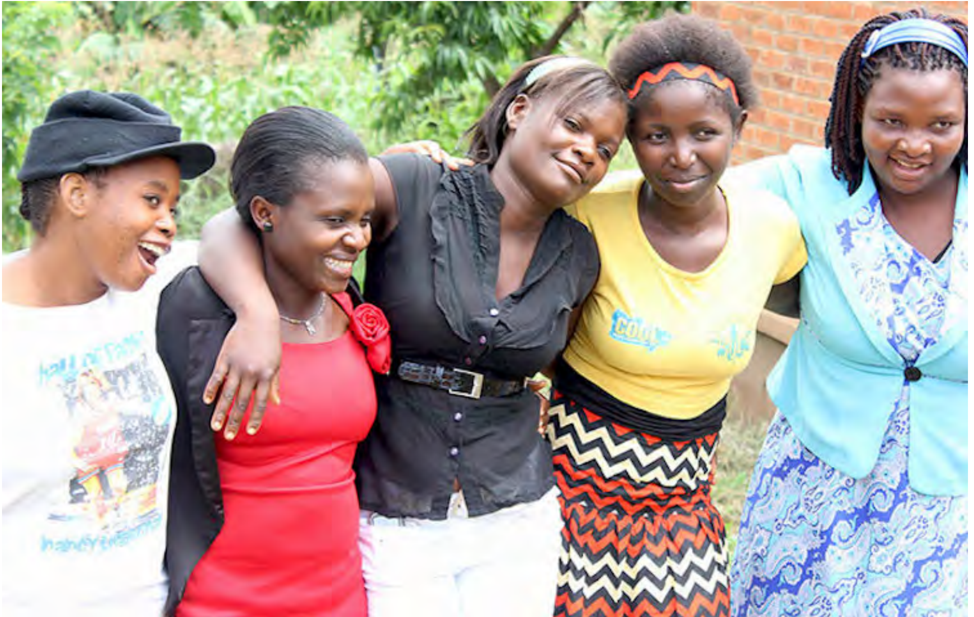
Image: Girls from the Safeguard Young People programme in Malawi, which provides sexual and reproductive health information, helps young people access health services, and offers leadership training