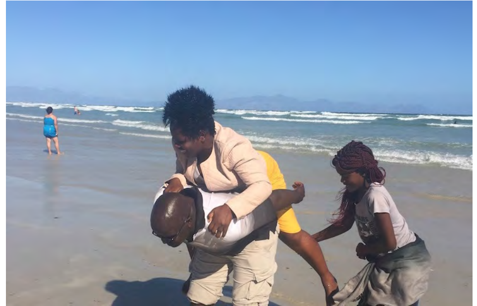
[IDN-InDepthNews – 5 June 2017]

Meanwhile, for Zimbabweans like Dube, giving a thought to ocean life may remain secondary. “Shall I breed diseases with garbage lying in my backyard because I have to protect some ocean life which I don’t see near me?” she asked.