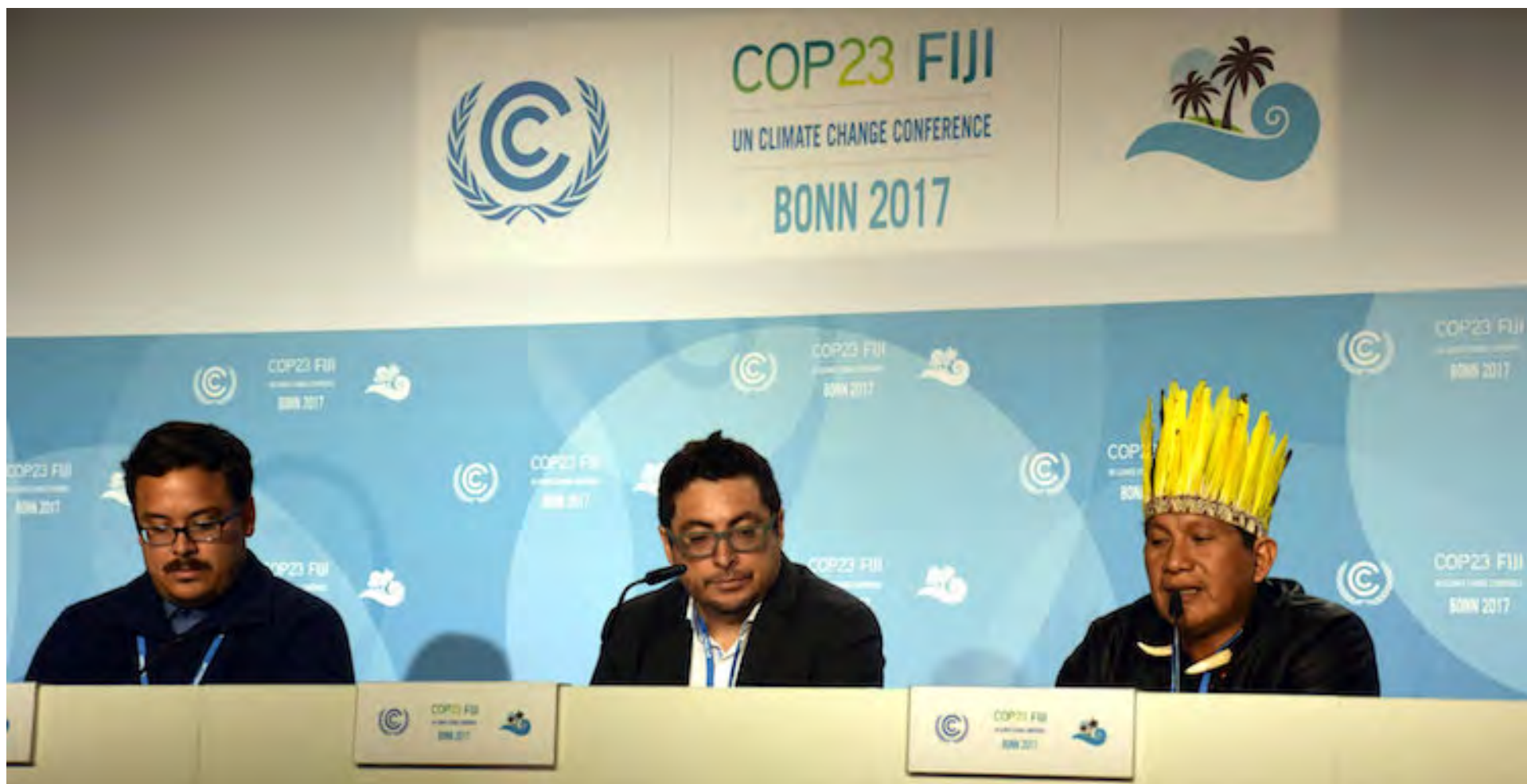
Image: Leaders from Indigenous communities speak at a press conference in COP 23