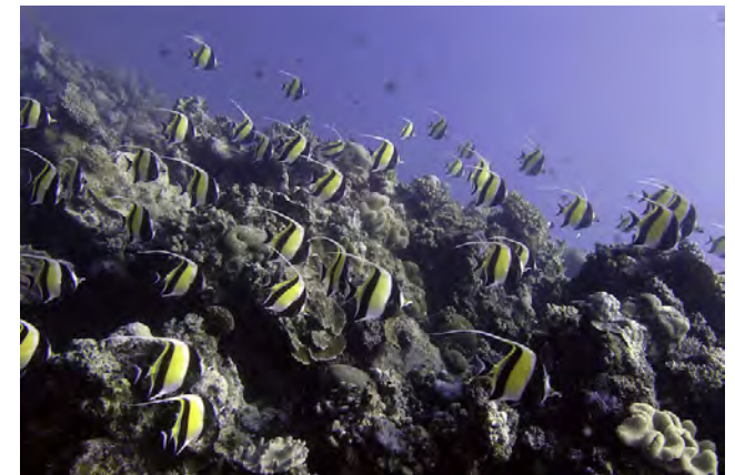
Image: A school of Moorish Idols cruise over the coral reef, Ha’apai, Tonga

“We cannot manage what we cannot measure, and no single country is able to measure the myriad changes taking place in the ocean. From Fiji to Sweden, from Namibia to the Arctic, all Governments and partners must share knowledge to craft common science-based policies,” Bokova added. [IDN-InDepthNews – 12 June 2017]