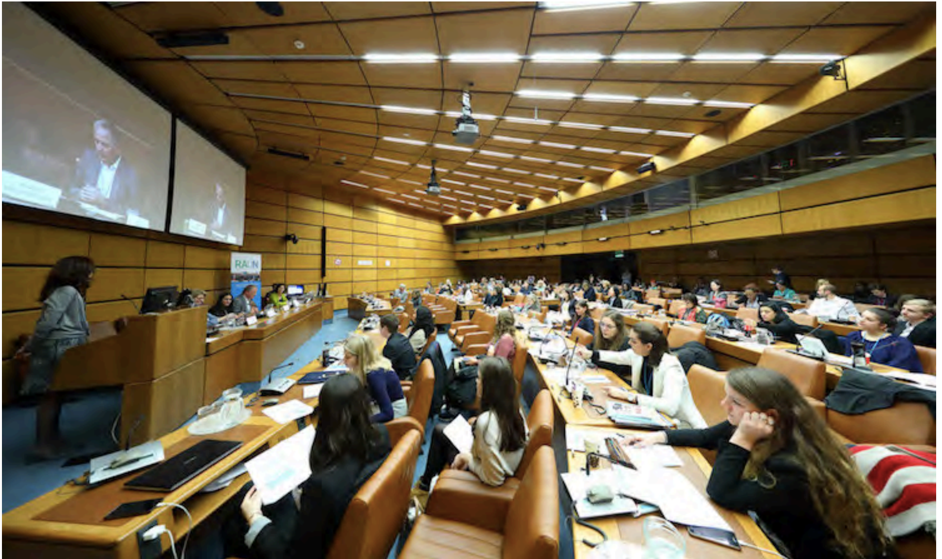
Image: A general view of the Vienna UN Conference