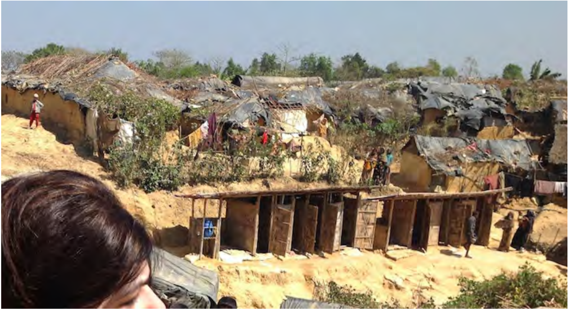
Image: Kutupalong Refugee Camp in Cox's Bazar, Bangladesh. The camp is one of three, which house up to 300,000 Rohingya people fleeing inter-communal violence in Burma