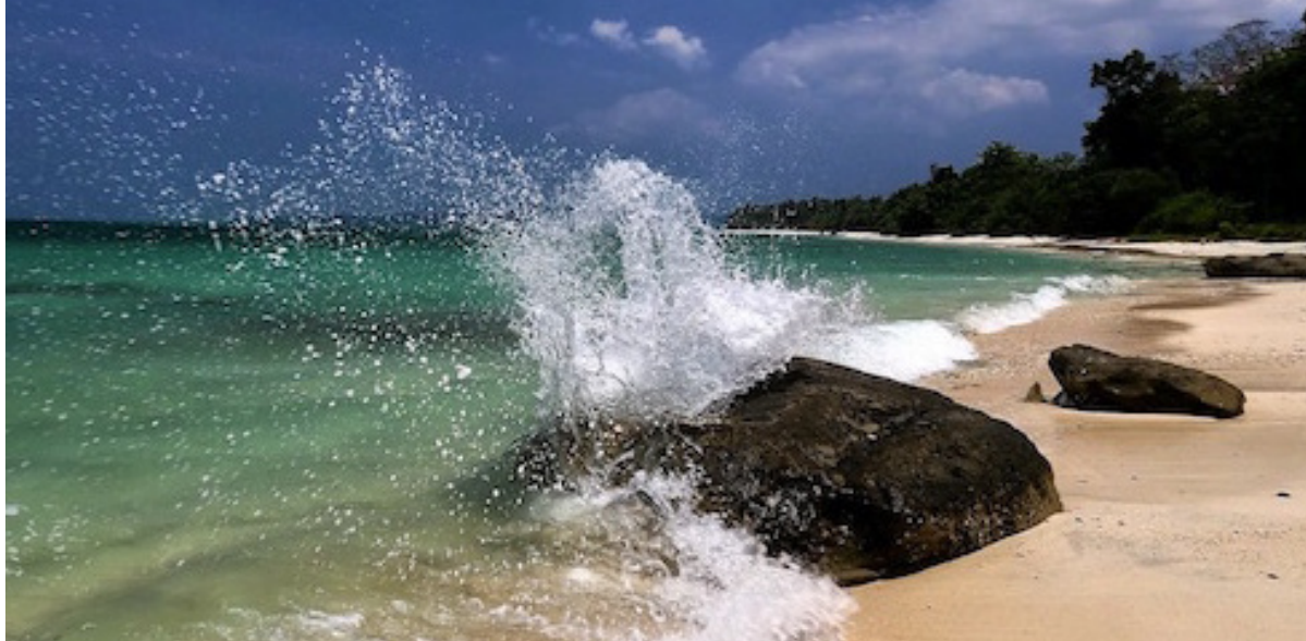
Photo: India's top beach destination Goa commits to #BeatPlasticPollution. Credit: World Environment Day.

BANGALORE (IDN) – A 32-year-old Rajeswari Singh launched on a six-week marathon mission on World Earth Day setting out to walk some 1,100 kilometres from Vadodara in western India to reach New Delhi on World Environment Day on June 5, spreading a simple message ‘Stop using plastic’, and accentuating it by forgoing all the way any kind of plastic packaged drinks or food.