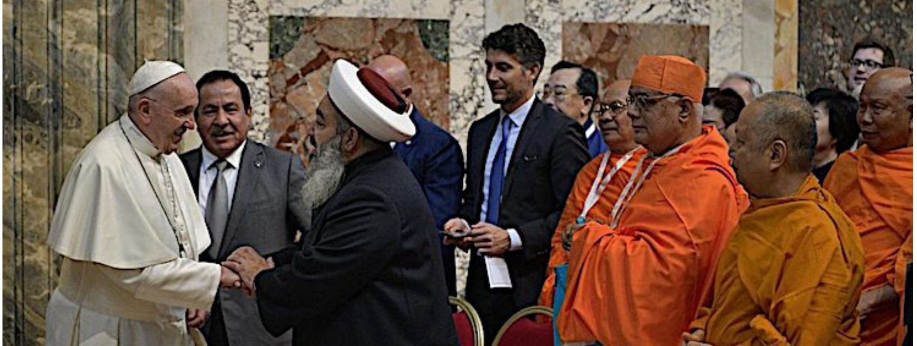
Photo: Pope Francis addresses participants of an international conference entitled, 'Religions and the Sustainable Development Goals'.

BERLIN | VATICAN CITY (IDN) – Much water has flown under the Tiber bridges since the Holy See declined an invitation in 1923 to join the League of Nations stating that its only competency was in matters of elucidation of questions of principle in morality and public international law.