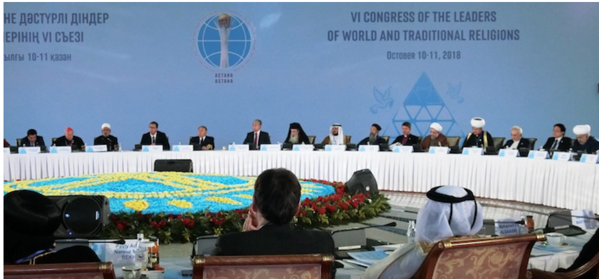
World Religious Leaders' Astana Congress Pledges 'Unity in Diversity'

ASTANA (IDN) – At a critical point in time when religious tolerance is being consigned to oblivion, an international conference has appealed “to all people of faith and goodwill” to unite, and called for “ensuring peace and harmony on our planet”.