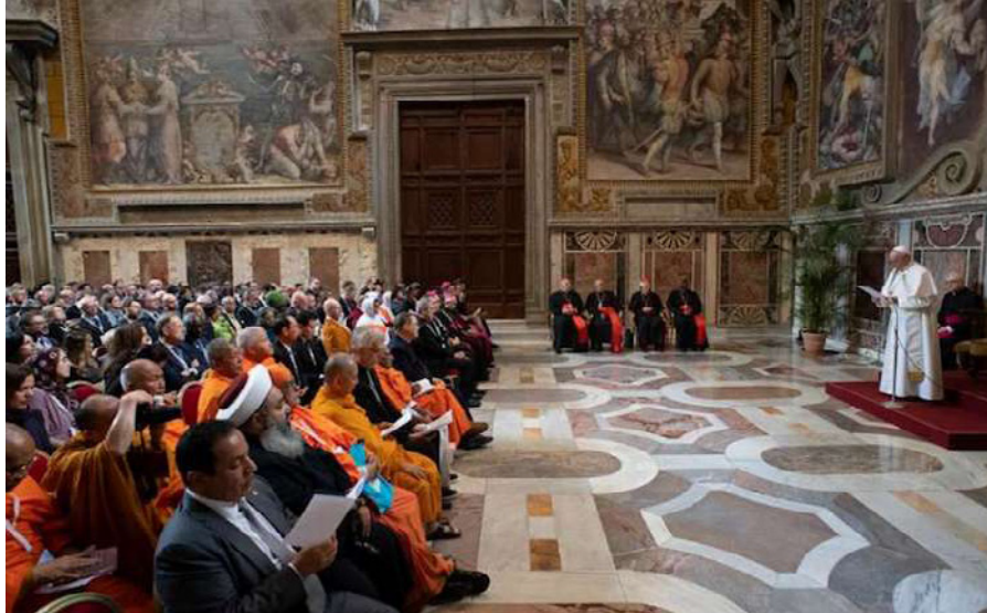
Photo: Pope Francis addresses participants in a conference on religions and the sustainable development goals, in the Vatican's Clementine Hall March 8, 2019.

VATICAN CITY (IDN) – Nearly six months before the heads of state and government convene to review the implementation of the 2030 Agenda for Sustainable Development at the UN General Assembly's 'SDG Summit' in September, the world religions have tasked themselves with elaborating “a road map or lines of action that can connect religious contributions to the implementation of the SDGs”.