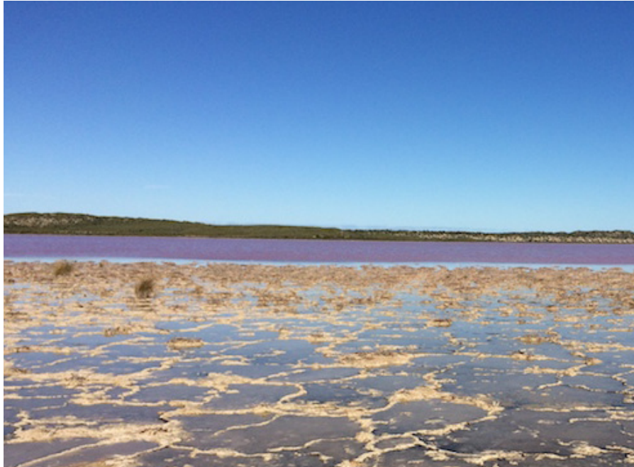
Photo: In a desert area located on the west coast of Australia. The lake looks pink because of Dunaliella.

The author is Project Associate Professor, Graduate School of Agricultural and Life Sciences, the University of Tokyo, Japan.