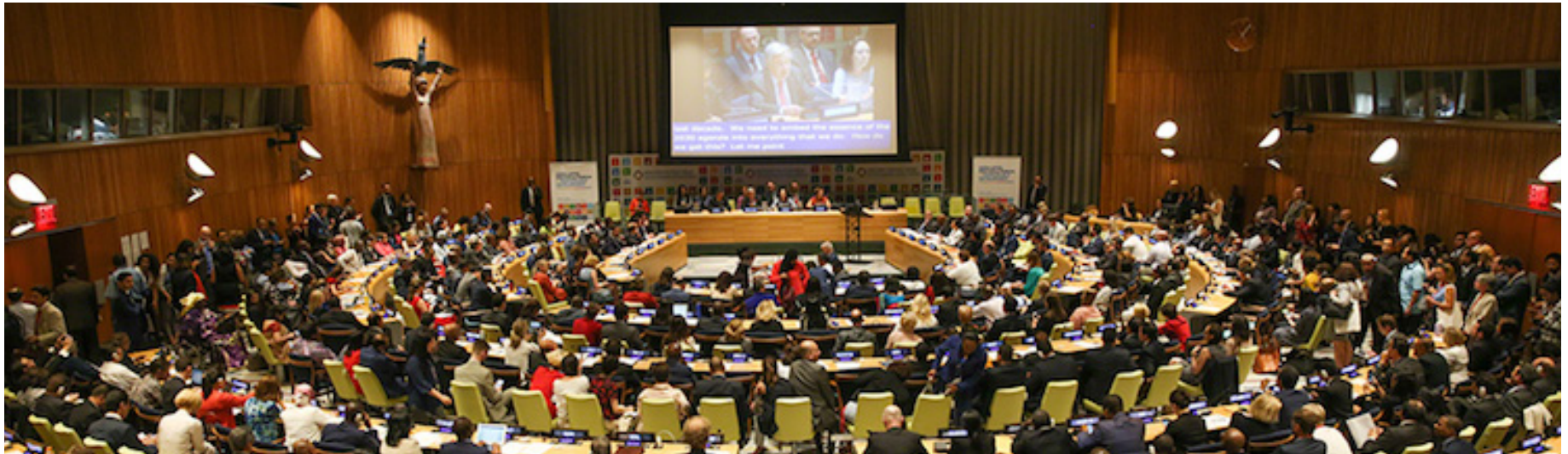
Photo: The 2018 High-Level Political Forum on Sustainable Development concluded on 16 July, following a full day of Voluntary National Reviews, and the continuation of the High-Level General Debate in the afternoon. A Ministerial Declaration was adopted during the closing session on the theme ‘Transformation towards sustainable and resilient societies.’

UNITED NATIONS (IDN) – Three years since the 2030 Agenda and the Sustainable Development Goals (SDGs) were adopted by the UN, at first glimpse progress seems to have been made in “transforming our world” by implementing “a plan of action for people, planet and prosperity.”