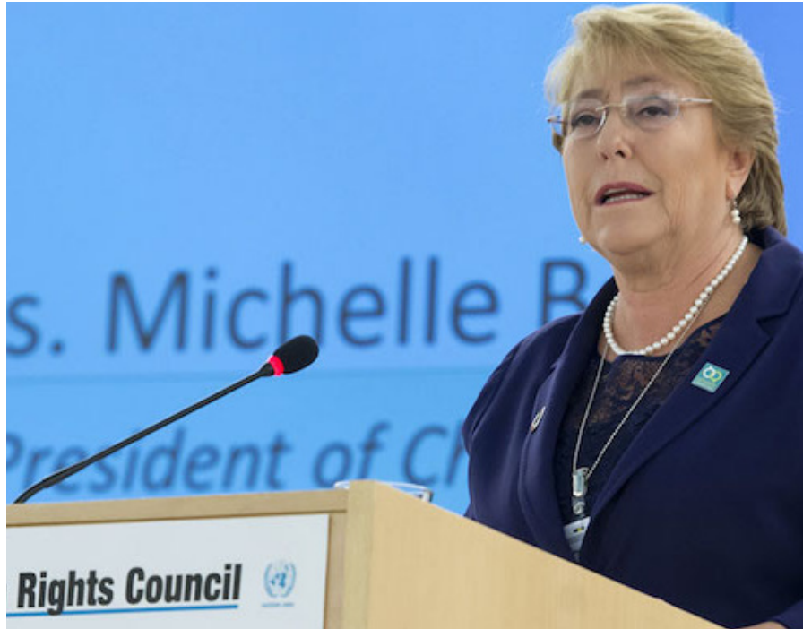
Photo: Michelle Bachelet of Chile, newly-appointed as the next UN High Commissioner for Human Rights by Secretary-General António Guterres.

NEW YORK (IDN) – Moments after the UN General Assembly unanimously agreed on August 10 to appoint Chile’s former President Michelle Bachelet as the seventh UN High Commissioner for Human Rights, Secretary-General António Guterres tweeted: “Ms. Bachelet is a pioneer, a visionary, a woman of principle, and a great human rights leader for these troubled times.” He had had put forward her candidacy to the General Assembly on August 8.