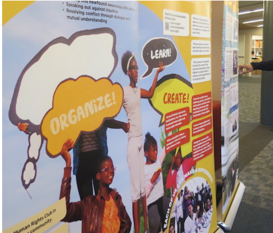
Photo: A glimpse of the exhibition on human rights education.

SYDNEY (IDN) – More investment is needed in human rights education and strengthening of civil society to address inequality and sustainability – the main objectives of the United Nations Sustainable Development Goals. This was the key message from the Ninth International Conference on Human Rights Education (ICHRE) held in Sydney, Australia.