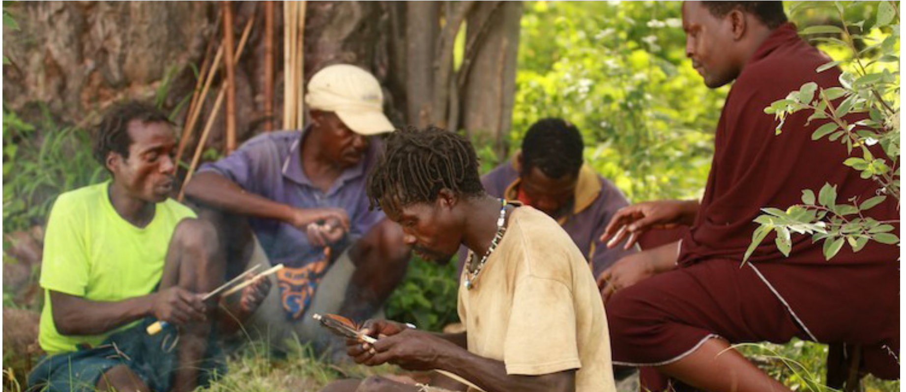
Photo: Members of the Hadzabe community in Manyara region making bows for hunting. The group is among beneficiaries of the mapping project run by the Ujamaa Community Resources Team.