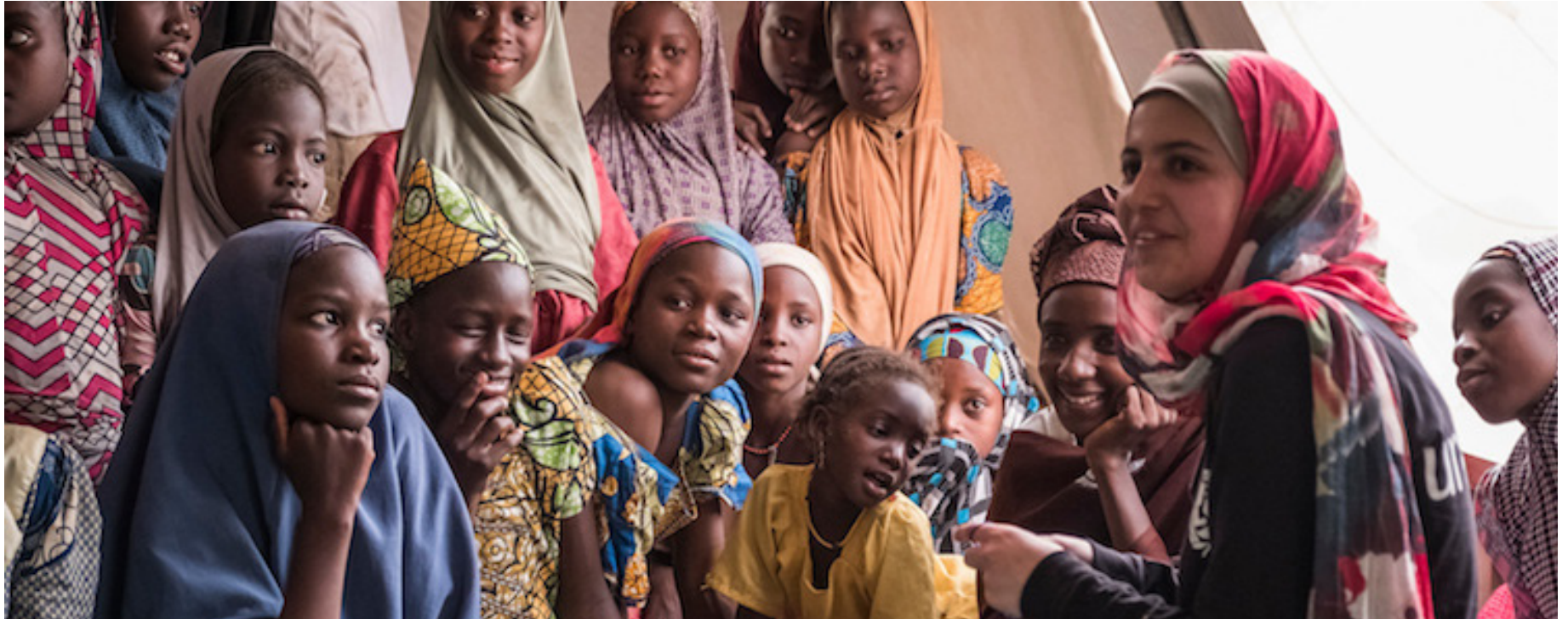
Photo: UNICEF's youngest Goodwill Ambassador Muzoon Almellehan in Chad.