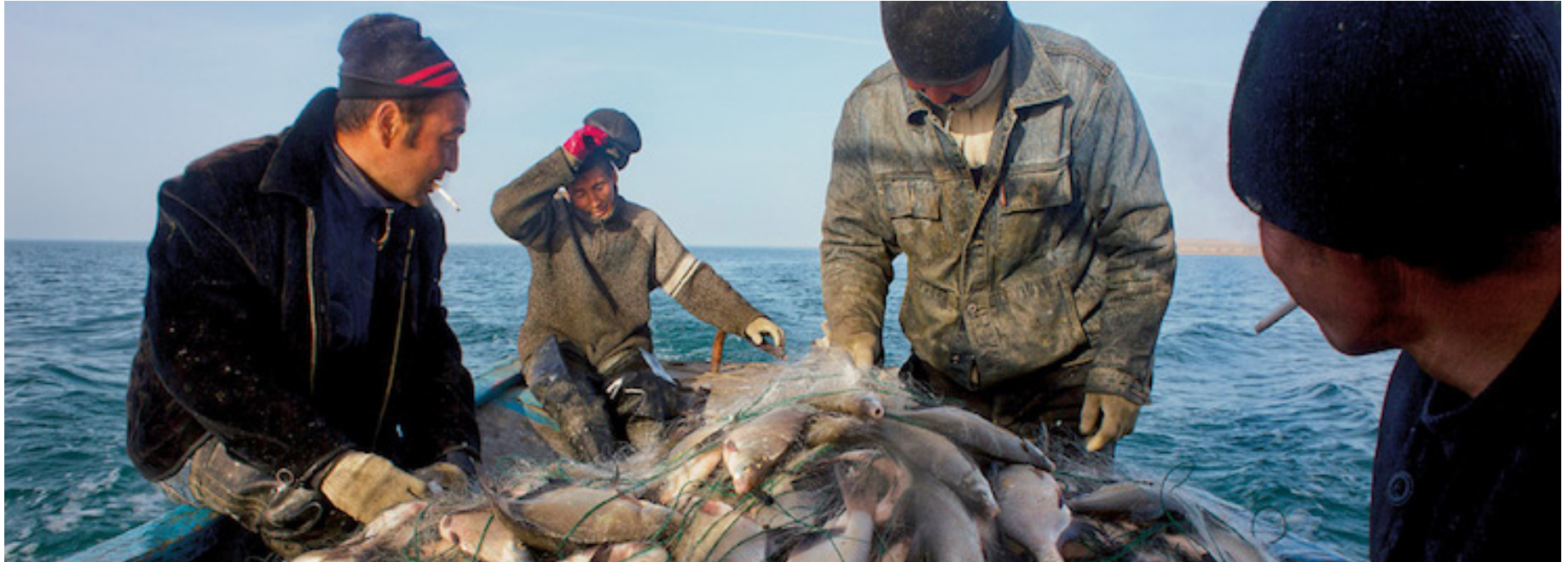
Photo: Working from dusk until dawn, fishermen from around the town of Aral in Kazakhstan haul in a catch from the North Aral Sea, where the water level has risen and salinity has decreased – in stark contrast to the larger South Aral Sea, which has gone nearly dry.

NEW YORK (IDN) - The zone of destruction created as a consequence of what has been called “one of the planet’s worst environmental disasters” has long crossed the frontiers of Central Asia, demanding urgent measures from the international community.