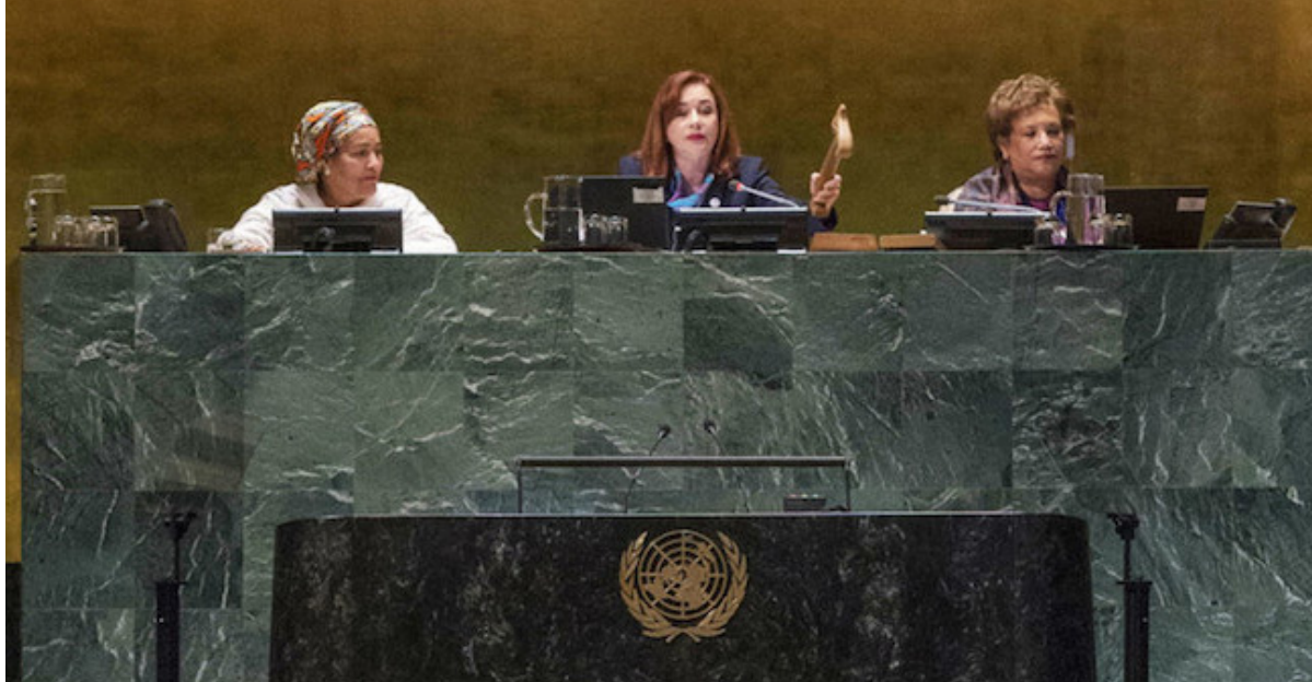
Photo: María Fernanda Espinosa Garcés, President of the seventy-third session of the General Assembly, gavels to a close the General Assembly's annual general debate.

NEW YORK (IDN) – As the new year unfolds, UN Secretary-General António Guterres' appeal for addressing the "trust deficit disorder" plaguing the world, and General Assembly President María Fernanda Espinosa Garcés' plea for stressing the need to enshrine the General Assembly as the "chief peacebuilding organization in the world" will serve as a clarion call to urgent action by the international community. All the more so be-