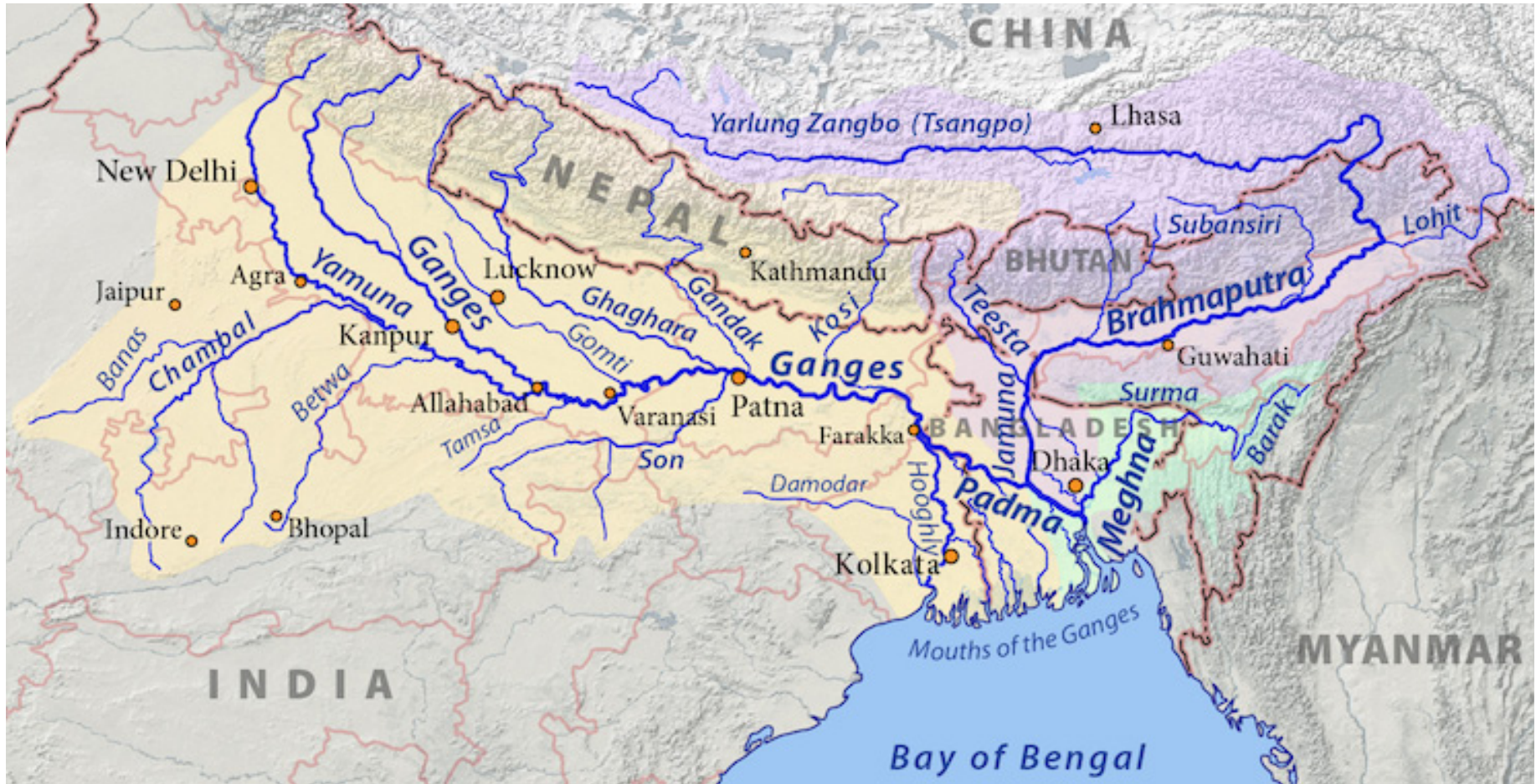
Image: Map of the Ganges (orange), Brahmaputra (violet), and Meghna (green) drainage basins.

BANGALORE (IDN) – As another scorching summer threatened to grip India and rivers began running dry, a hectic debate ensued about